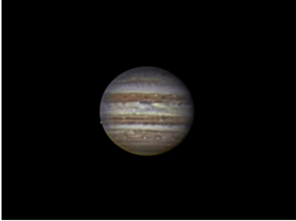
10" refractor image by Scott Tucker

So why would someone buy an achromatic refractor versus a reflector in the moderate price range (say, under $1000)? We primarily recommend achromats for people who want to do terrestrial observing as well as stargazing. This is because a refractor gives a correct image while a reflector inverts the view. But for just stargazing, you can get more aperture and a higher-contrast view for the money with a reflector.