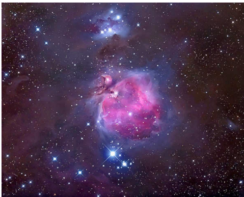
180mm f/2.8 astrograph image by James McGaha

Speed is also an advantage of astrograph systems. Most wide-field astrographs have focal ratios of f/2.8 to f/3.5. As a specific example, Takahashi's Epsilon 180 astrograph is equivalent to a 500mm f/2.8 lens. It has the same focal length as the usual small refractor, but has 7 inches of aperture and much more speed. So why are small refractors, including Takahashi's own offerings, so much more popular than the astrograph? One reason is collimation, which is not required for a refractor, while it is critical and somewhat difficult on an astrograph.