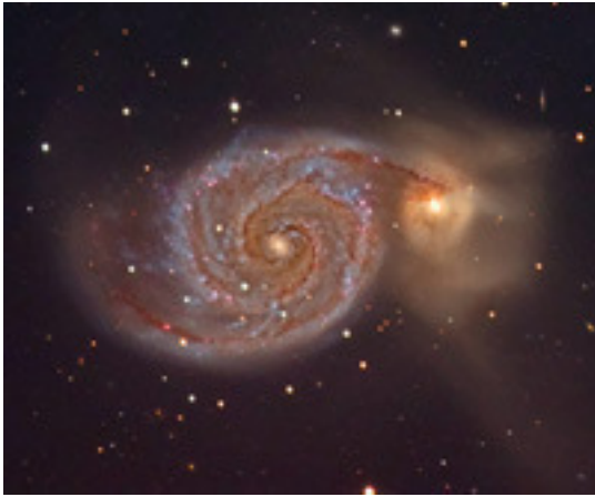
Hyperion

An RC can give a flat, aberration-free field of view with a field corrector, which is normally available, but does not do so inherently. Most professional telescopes are RCs, and they do employ field correctors. With such a corrector in place, the image quality of an RC is exquisite. However, other designs exist, such as the Hyperion telescope, which can produce similar aberration-free fields of view without the expense of the difficult-to-manufacture hyperbolic mirrors of the RC.