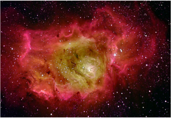
HyperStar C14

So why are small refractors so popular? Part of the reason is that many users of refractors also have long-focal-length telescopes such as a Ritchey-Chrétien or SCT as a primary imaging instrument and the refractor compliments that system. Of course, the other options similarly compliment those systems as well. But a refractor is easy to piggyback on the main telescope, which explains part of the popularity. That said, a camera lens is easily piggybacked as well. And for those who do not need to piggyback an instrument, any of the other options are viable.